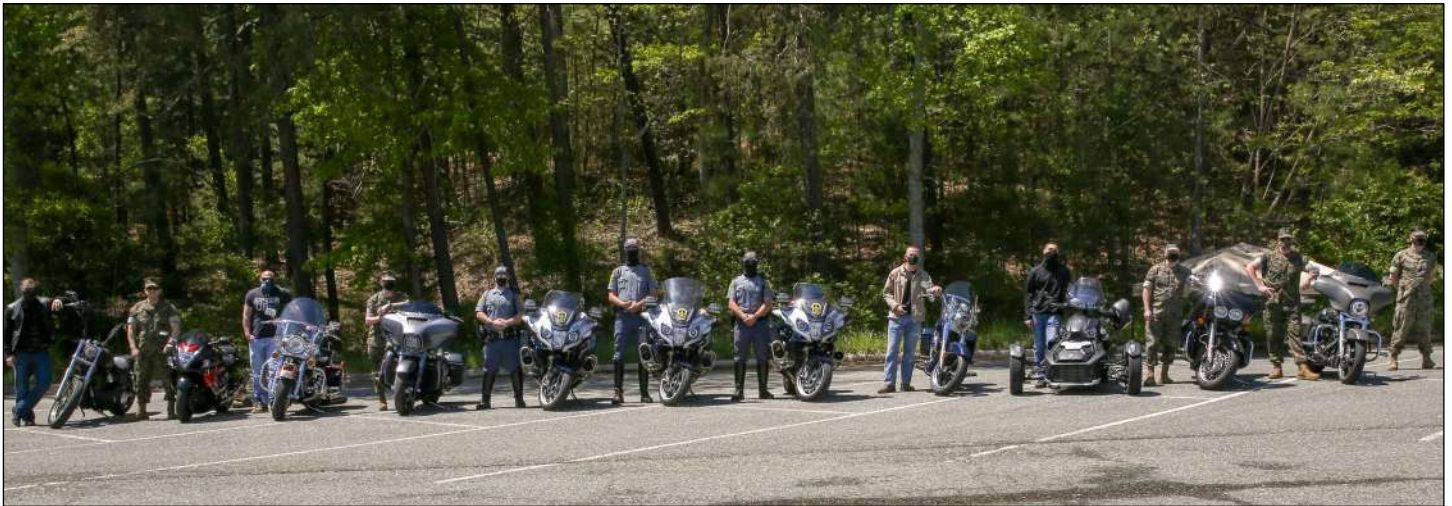
Members of the Motorcycle Mentorship Program (MMP) assemble during their monthly meeting April 26, 2021, on Marine Corps Base Quantico, Virginia. The purpose of the MMP is to establish voluntary installation-level motorcycle programs where less-experienced and seasoned riders can create a supportive environment of responsible motorcycle riding and enjoyment.

Additional Motorcycle Rider Down Reports are available at